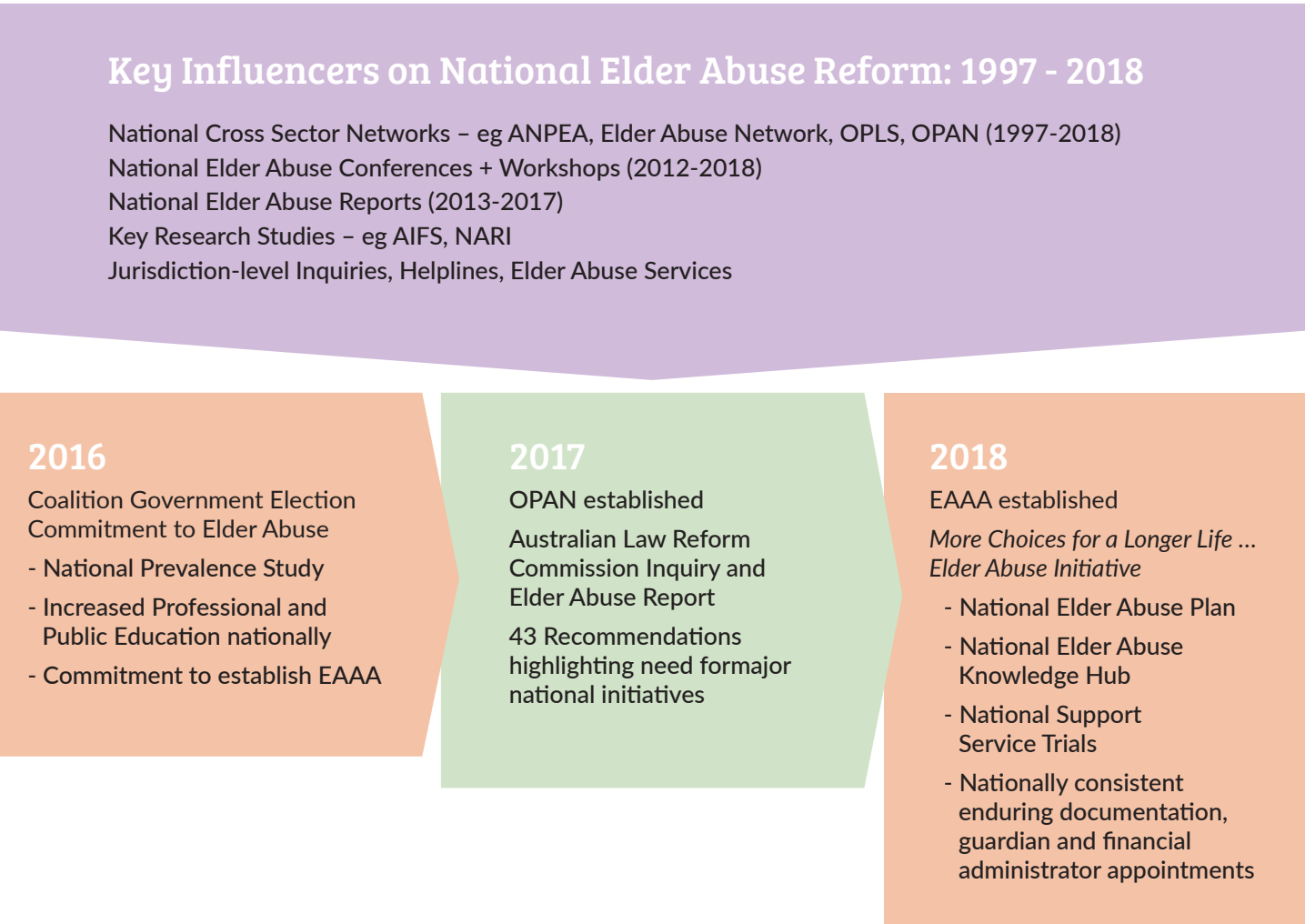
FIGURE 1: RECENT NATIONAL REFORM TO ADDRESS ELDER ABUSE

The recent key national influencers of reform are outlined in the figure below and selected breakthrough influences outlined within the following section.